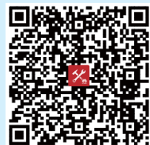
Huawei Enterprise Support

Copyright © Huawei Technologies Co.,Ltd. 2019. All rights reserved.